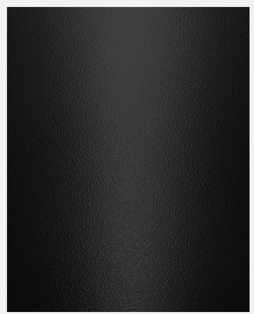
powder coated textured