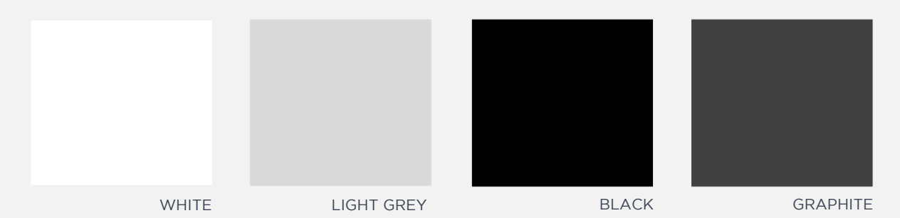
Please accept actual colors may vary. This is due to computer monitors displaying colors. We try extremely hard to ensure our photos are as life-like as possible, but please understand the actual color may vary slightly from your monitor.